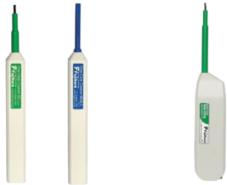
One-Click Cleaner SC, ST, FC and LC/MU