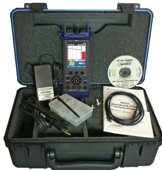
M200 OTDR in a hard case