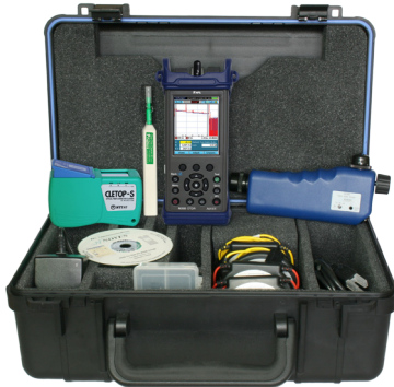
M200 OTDR Hard Case Kit for Mining

For ordering information, refer to the table below.