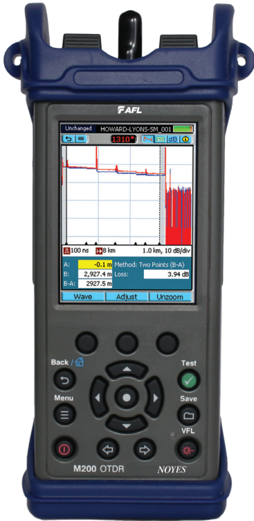
M200 OTDR with new User Interface