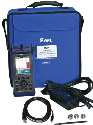
M200 OTDR in a soft case

The NOYES M200 OTDR is also available in a tough injection molded ABS carry case (available as an option - HC). The rugged transit case has a full length hinge, padlock loops, secure snap latches and an O-ring seal to protect the contents from dust and water. In addition to the OTDR, the custom case has room for cleaning products, launch and receive rings, documentation and more.