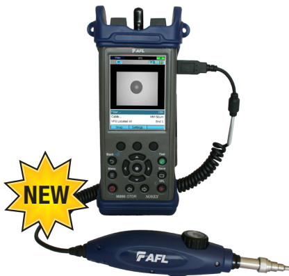
M200 OTDR with DFS1 Digital FiberScope

The NOYES M200 OTDR from AFL combines ease of use (Touch and Test™) and functionality in a field-rugged, hand-held package. With single-mode dynamic ranges of up to 26 dB and multimode dynamic ranges of 22 dB, the M200 is ideal for testing and troubleshooting enterprise, LAN/WAN, metro, and service provider networks. Testing at 1310 and 1550 nm is normally sufficient to certify single-mode point-to-point fibers and allows the detection of macrobends. The M200 supports Full Auto, Expert (manual) and Real-Time OTDR test modes, precision event analysis, and multi-wavelength testing.